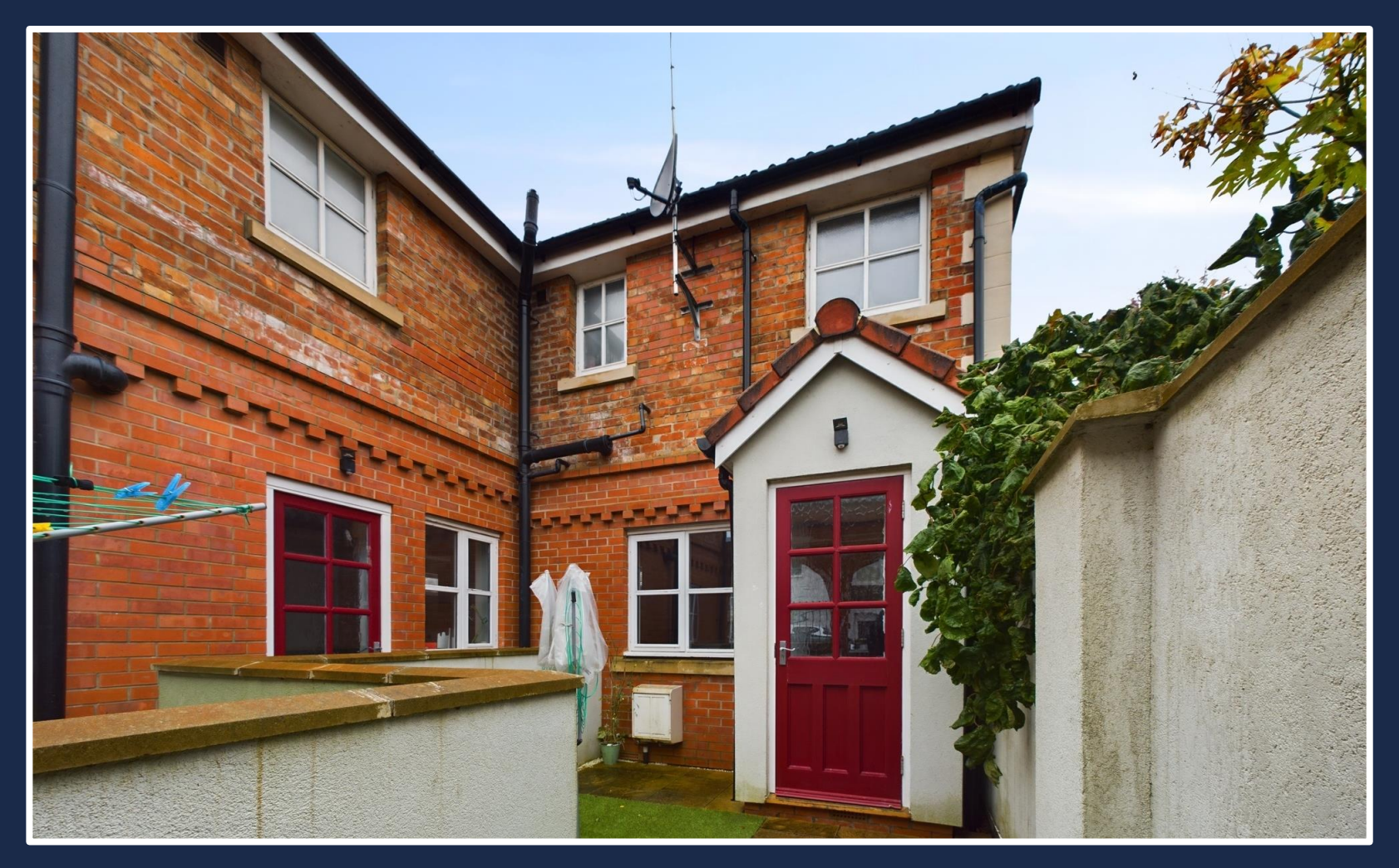
45b Swiss Road, Weston-super-Mare, North Somerset, BS23 3AY